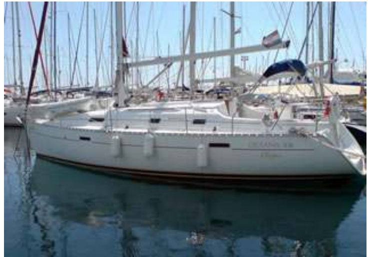
Inventory list: Oceanis 331 (2002)